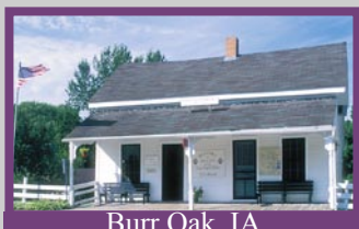
Burr Oak, IA