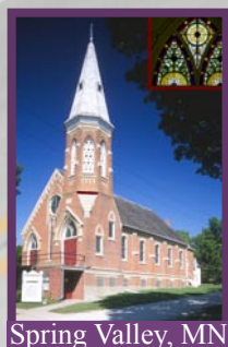
Spring Valley, MN