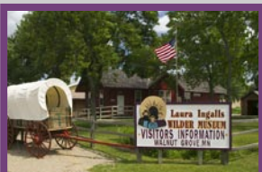
Walnut Grove, MN

You will experience her insight and her love for her family.